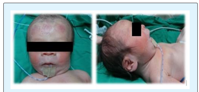
Figure 2: The infant that presents facial features of Miller-Dieker Syndrome.

Echocardiogram demonstrated a moderate perimembranous type of VSD at birth. Intermittent seizure like activity was observed, and epileptic encephalopathy was found in electroencephalography. After administering pentobarbital, seizure activity was not seen. Taken together, the authors diagnosed MDS although genetic test was not performed. After two months, the defect size of VSD was increased to 8 mm. Also, desaturation up to 80%, tachypnea and subcostal retraction were observed and aggravated. Although VSD closure might not be helpful, palliative pulmonary artery banding was decided to relieve symptoms above.