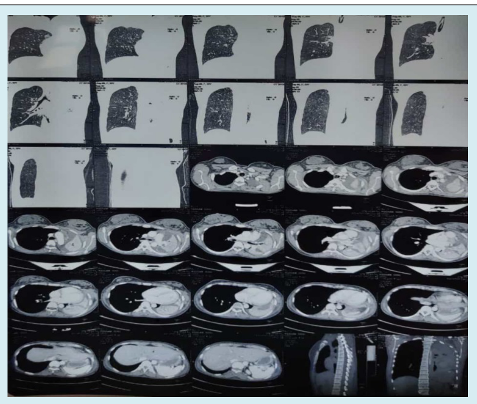
Figure 2: Contrast-enhanced computed tomography chest showing complete collapse of left lung, with mediastinal shift and pleural effusion with pneumothorax.